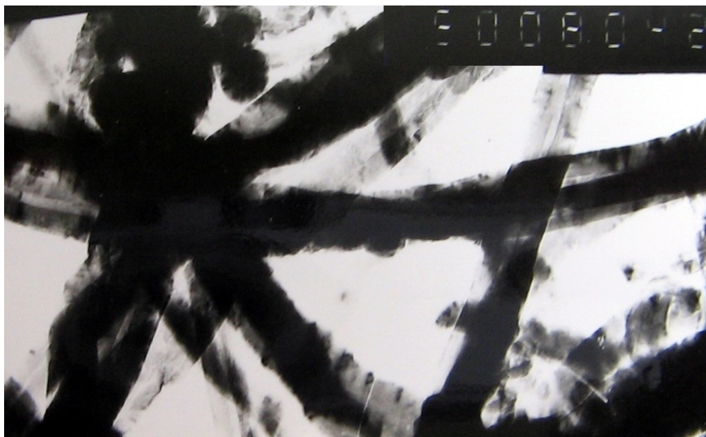
Transmission Electron Microscopy (TEM)